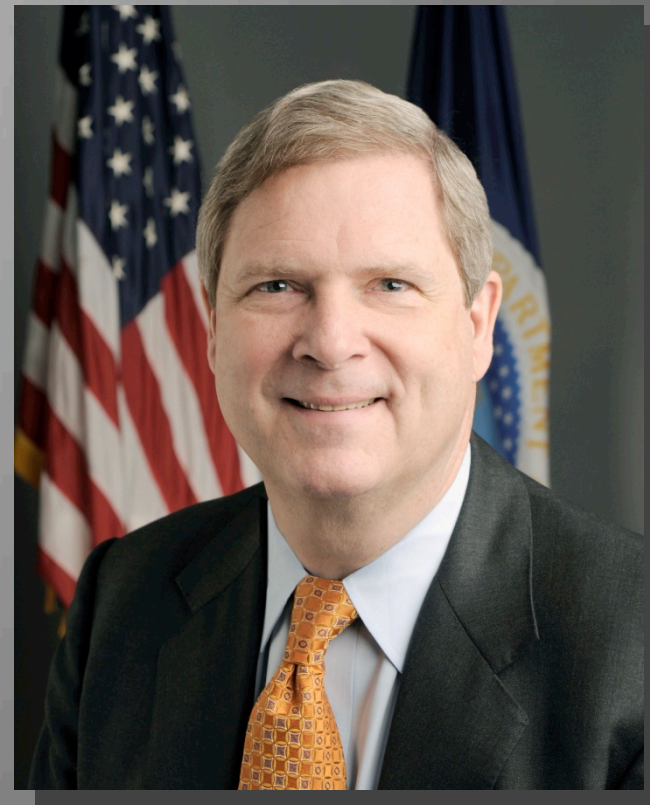
Secretary of Agriculture Tom Vilsack